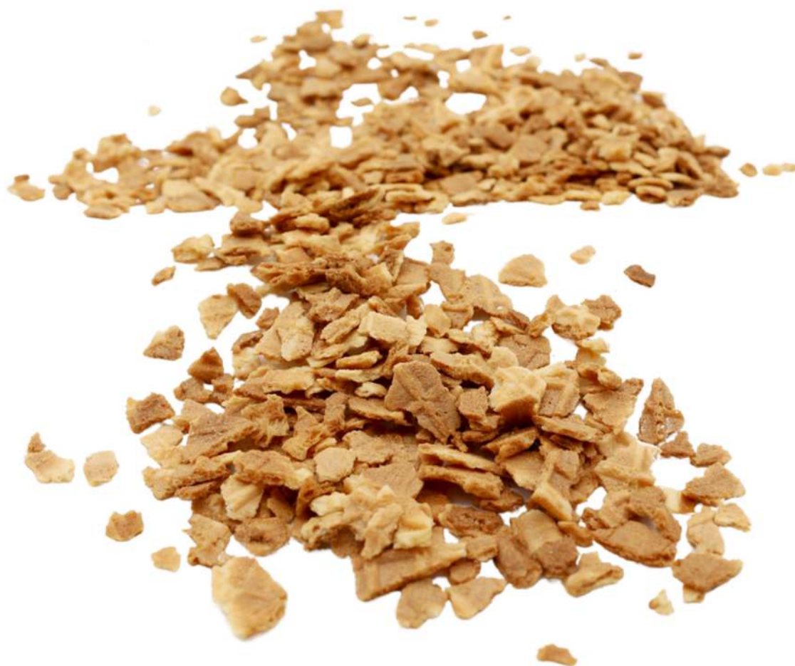
GRANELLA DI CIALDA